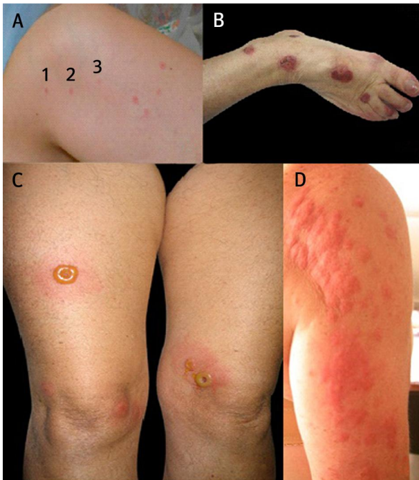
Fig 3 Clinical manifestations of bed bug bites: three or four skin lesions are often seen in a “breakfast (1), lunch (2), dinner (3)” distribution (A) or “wheel” distribution (B). Atypical bullous lesions (C) and urticaria (D)